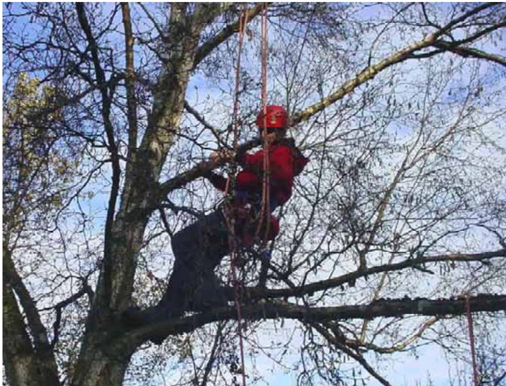
Plate 4 - Evaluation Using Two Load Bearing Anchors To Move Around A Typical Garden Sized Tree.

If best practice guidance is not seen as practical, the industry is unlikely to use it as strict guidance and therefore a barrier is placed in the adoption of safe systems of work. By ensuring the revised GTGCP is practical, the working group are confident the industry will use it.