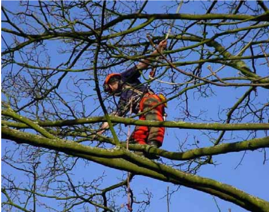
Plate 1 - Typical Current Tree Climbing Technique Using A High Anchor Point and Supplementary Anchor Points.

To clarify where the various techniques fell within the accepted definitions a demonstration of best practice and a more typical working situation was given so that the HSE representatives could form an opinion of what constituted 'Work Positioning' and 'Rope Access and Positioning'.