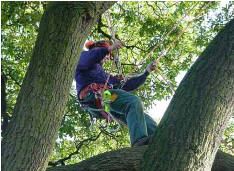
Plate 2 - A Climber Using Two High Load Bearing Anchor Points To Move Around A Large Open Crown

A record of the evaluations both practical and verbal is provided in Appendix 2 and inform the conclusions and recommendations made in section 7.