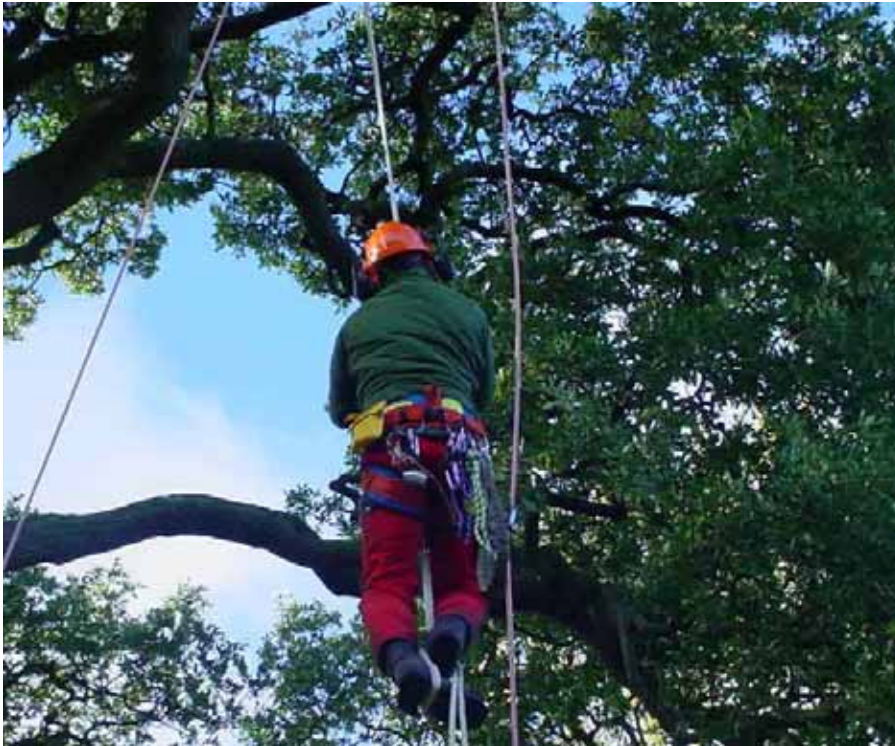
Plate 3 - Secured Foot Locking With A Back Up Line

A variety of ways of achieving a second line were evaluated and compared to existing practices. The group determined that in arboriculture this method was only used for access and was of short duration. By comparison, operators using rope access and positioning in other industrial contexts would also carry out work activity from the system. This doesn't take place in arboriculture and so correspondingly the chance of system failure is reduced.